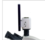
(Shown mounted on a microscope)