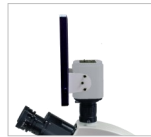
(Shown mounted on a microscope)