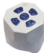
720P HD 30 / 5MP 12x - 200x Zoom #AU-500-MADM