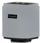
1080P HD 30fps HDMI & USB #AU-300-HD