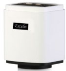
1080P HD 60fps HDMI & USB #AU-600-HD