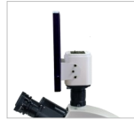
(Shown mounted on a microscope)