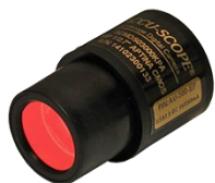
USB 2.0 Mini / 3MP Color CMOS #AU-300-EP