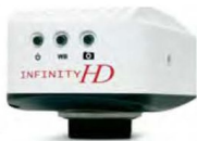
1080P HD 60 16:9 - HDMI #AU-200-HD