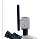
(Shown mounted on a microscope)