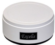
16MP Color CMOS USB 3.0 #AU-16-CMOS (MPX-16C)