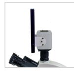
(Shown mounted on a microscope)