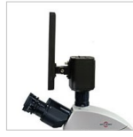
(Shown mounted on a microscope)