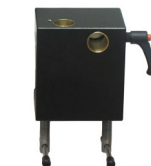
C-clamp Mount #15351