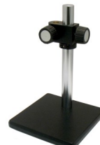
Pole Stand/Heavy Base #15349