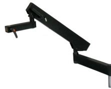
Articulating Flex Arm #15350